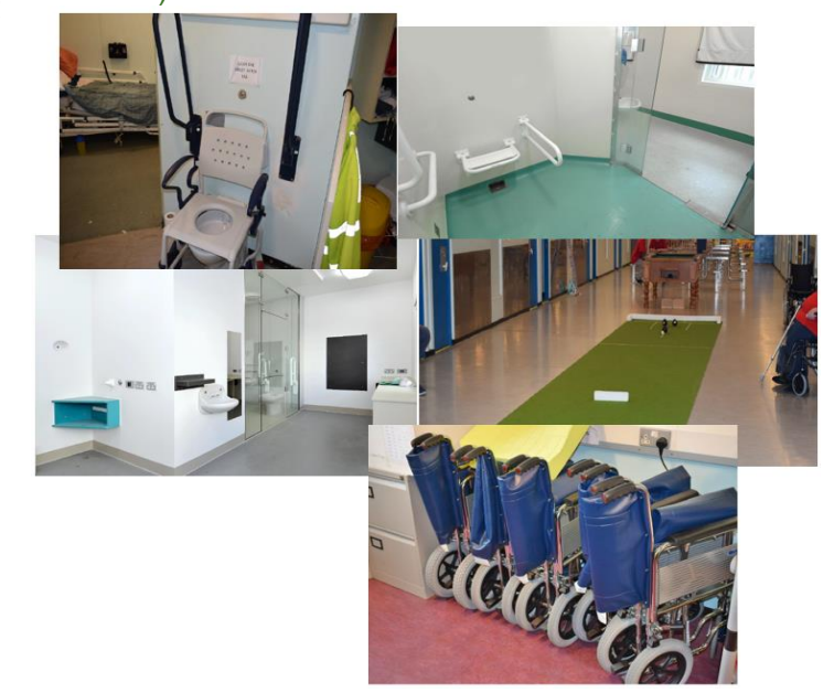
Figure 1 - Increasing Physical Access within Scottish Prisons

SPS is successfully working on making their estate more physically accessible (Figure 1). This report recommends that changes to the physical structure of the SPS estate is combined with cultural change in working practices, and enhanced knowledge and understanding of working with a diverse prison population to meet multifaceted social, psychological and physical dimensions of social care.